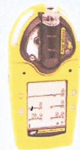
GasAlertMicro 5 PID Pump version