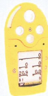
GasAlertMicro 5 PID Diffusion version